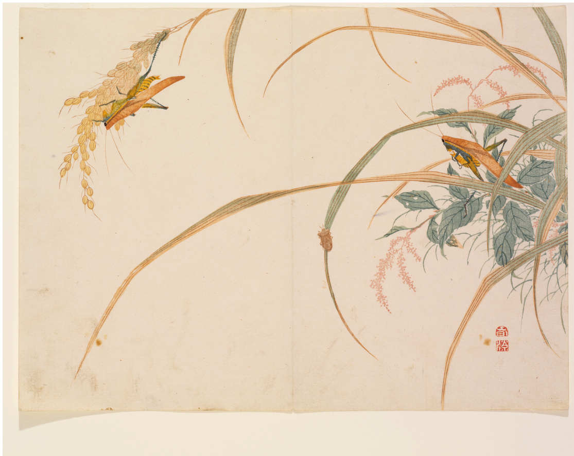
Figure 2. Grasshopper and bee, Things creeping under hand. Woodblock print by Mori Shunkei, 1820. [80].

Celebration of edible insects has also found expression in art and folklore worldwide. Two examples of this that involve edible insects found in agricultural systems include the appearance of the rice grasshopper ( Oxya spp.) in Asian art and poetry, and the role of the termite in African folklore. Asian art often expresses seasonality, and as such the seasonally available grasshopper, which is traditionally collected from agricultural fields in September, is a recognized symbol of the end of summer and beginning of autumn (Figure 2).